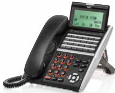
DT430 & DT830