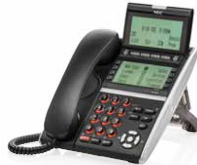
DT430 & DT830 Self-labelling