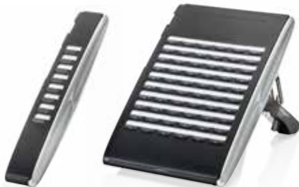
8-line Key Module